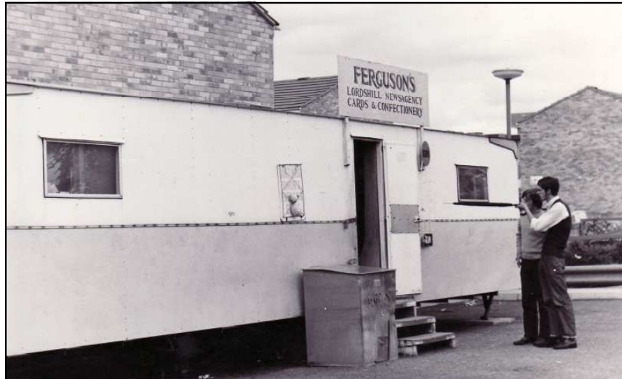
The caravan in Lower Brownhill Road 1968, before the shops were built.

The girl leaned over and said, "Burr gurr king!"