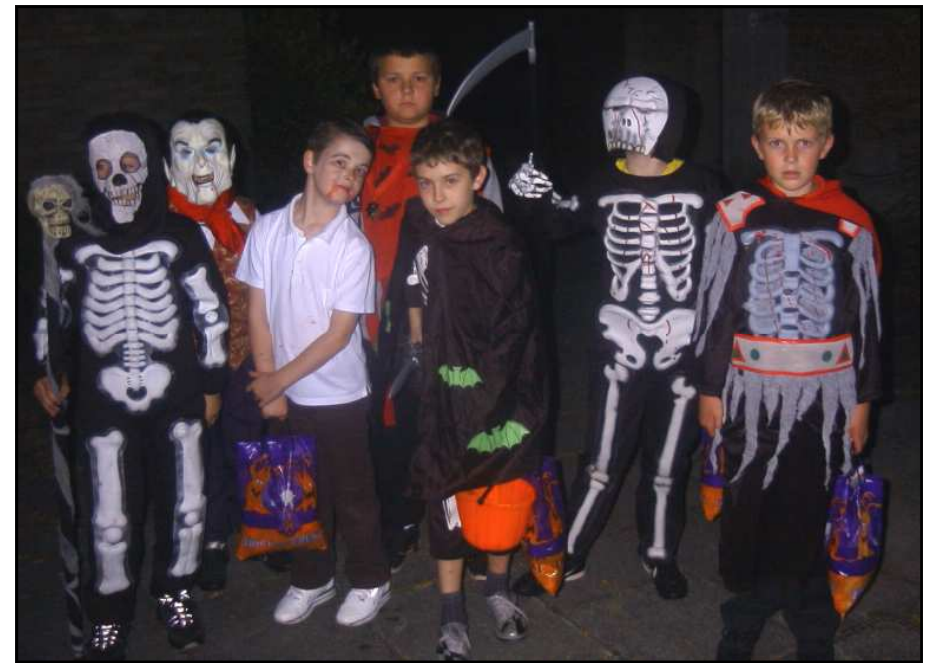
Halloween see page 2